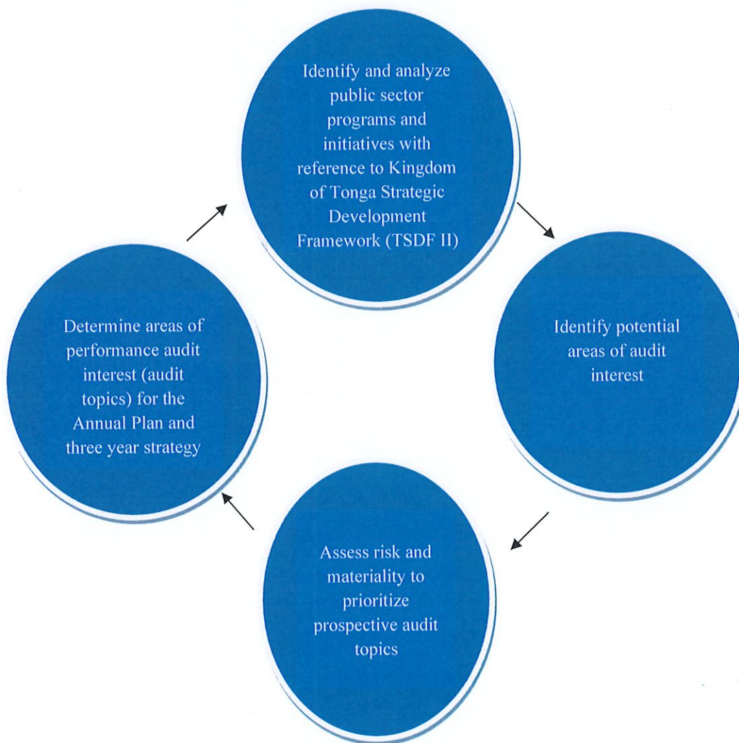
Performance audit topic selection framework